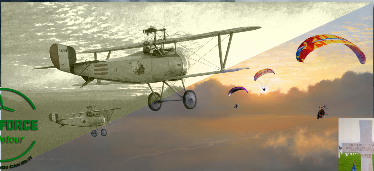
US monument Monfaucon

We fly over both sides of the river La meuse and visit famous places like Fort Douaumont, the Ossuaire, Village Fleury, Cote 304, le Mort-Homme, Montfaucon d'Argonne, Romagne Americain Cemeny and many more..